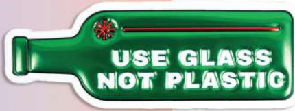
Flexstyle Domed Emblem

2025 is a year that stands out from the rest, and fashion reflects that. While fabrics, threads, colors, and textures each play a vital role in constructing garments, it's the careful curation and incorporation of intricate details that transform simple pieces into one-of-a-kinds.