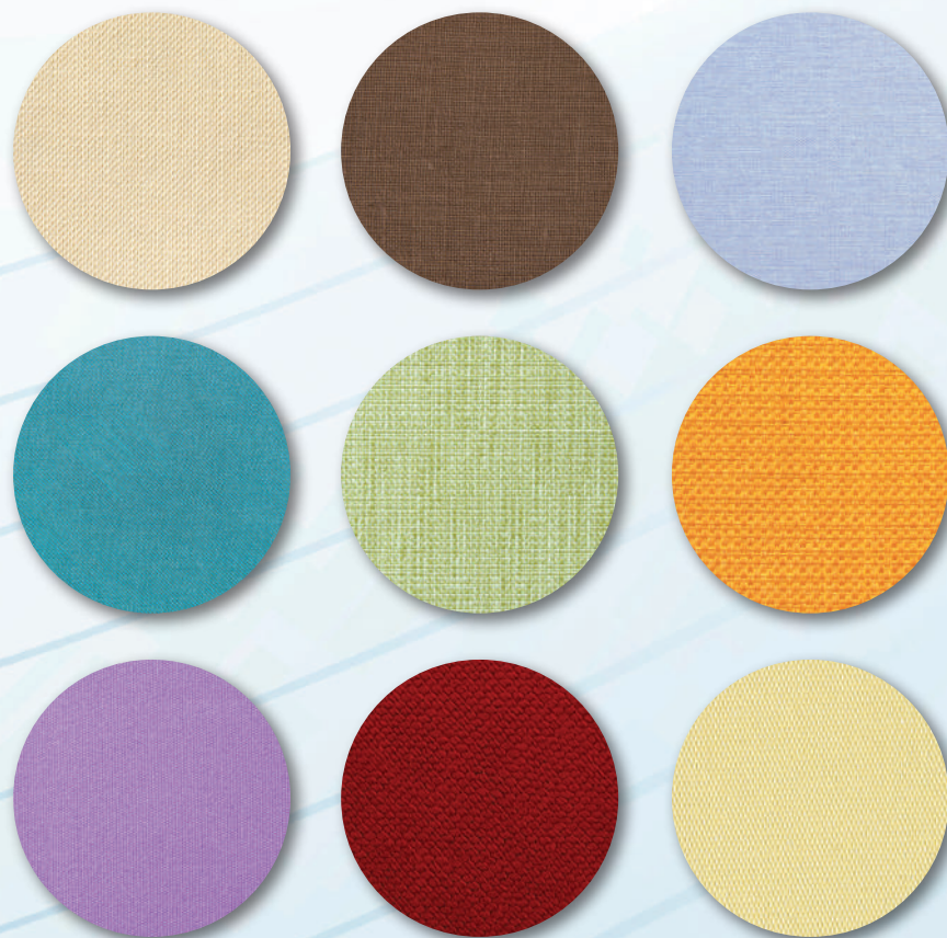
Spring and Summer Colors & Textures

As the seasons change and the weather continues to warm, a renewed desire for natural and sustainable fabrics is set to take over the Spring and Summer of 2025—reflecting an evolution in consumer priorities that seek a balance between the environment, style, and authenticity. Mocha Mousse echoes this sentiment and trickles down to how consumers interact with what they buy. Fresh, natural fabrics like cotton, linen, hemp, and silk fulfill this search for honesty while offering an ideal blend of sustainability, practicality, and timeless charm.