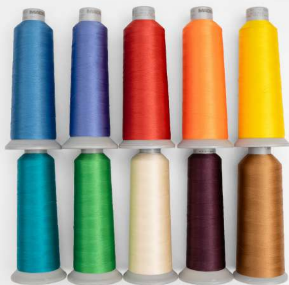
World Emblem Thread Colors