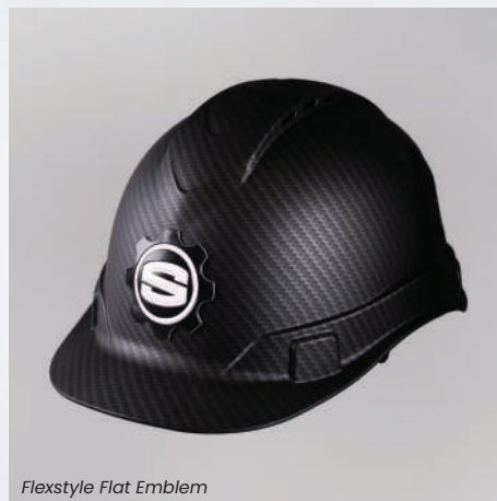
Flexstyle Flat Emblem