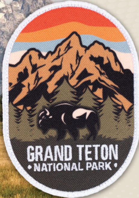
Print Stitch Patches

2025 is a year for grounding, encouraging us to immerse ourselves in nature and open our eyes to the inspiration in front of us. The rich, earthy hues of Mocha Mousse invite us to explore the colors of the outdoors, reminding us to connect with the roots below us.