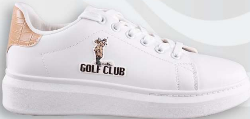
Flexstyle Flat Non-Metallic

For those looking to add a little extra shine, FlexStyle Flat also comes in a striking metallic finish. This finish provides an aesthetic twist to your footwear, adding a sleek, reflective shine that stands out in any light.