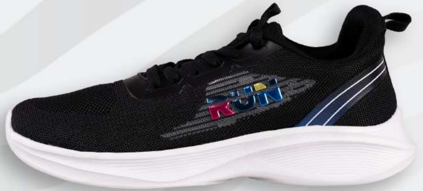
Flexstyle Flat Metallic

FlexStyle Flat is the perfect addition to sneakers for branding or personalization. Its sleek matte finish is ideal for showcasing modern designs while ensuring durability that withstands everyday wear.