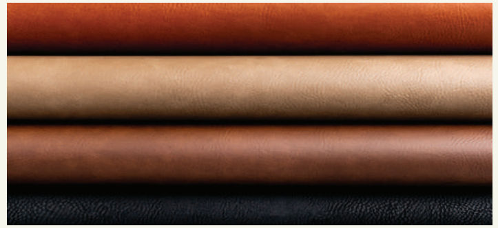
Leather Colors Available at World Emblem

Mocha Mousse depicts our search for authenticity, highlighting consumer preferences shifting towards more conscious interactions with what they buy. Whether you're in the fashion industry or run a textile business, this guide will help your brand navigate the best path to connect with buyers—starting with Mocha Mousse.