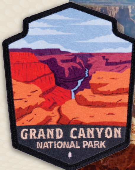
Print Stitch Patches