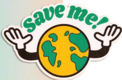
Sublimated Faux Suede Patch