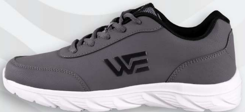
Flexstyle Flat Non-Metallic

Shoes tell a story, and with every step, FlexStyle emblems brings these stories to life, transforming your kicks into a canvas for expression.