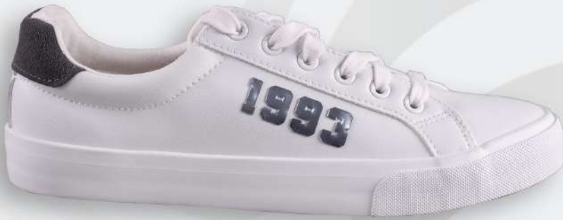
Flexstyle Flat Metallic

Going beyond fabrics, shoes and accessories are equally important to fashion, and what better way to step up your style than by decking out your kicks!