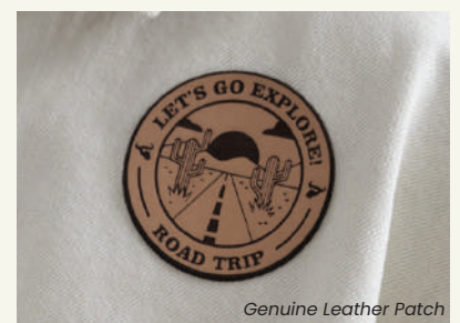
Genuine Leather Patch