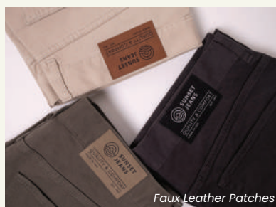
Faux Leather Patches