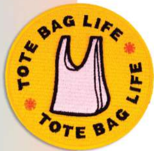
3D Embroidered Patch