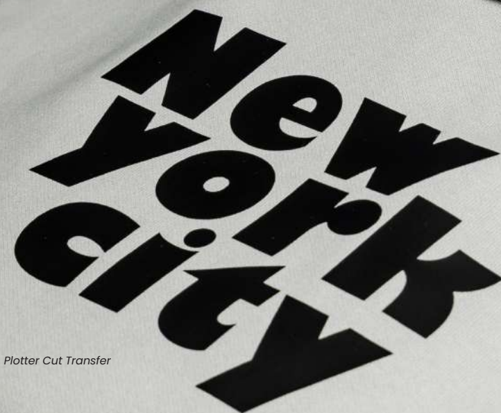
Plotter Cut Transfer

Elevate your hat game with a variety of patch and emblem styles, transforming your headwear into statement pieces that speak volumes. Embroidery, 3D Embroidery, and Direct Embroidery are part of the same family, capturing even the most intricate details of your designs. On the other hand, Flexbroidery offers an alternative to direct embroidery, providing the same look without the use of thread! Meanwhile, Woven Patches and PV+ emblems are other options that offer crisp lines and a modern dynamic twist.