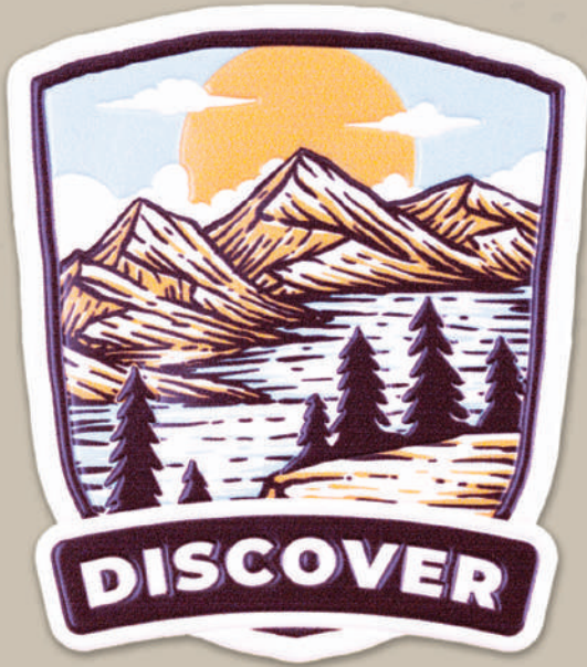
Flexstyle Flat Emblems

Brown shades reminiscent of log cabins, tree trunks, and earthy trails are translated into summer fashion and speak the language of the season. Patches and emblems can also bottle the season's essence by recreating summer themes on garments.